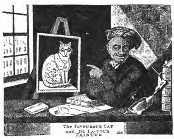
(REDUCED FROM THE PLATE.)

WITH BIOGRAPHICAL SKETCHES AND ANECDOTES.